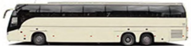
BUS & COACHES